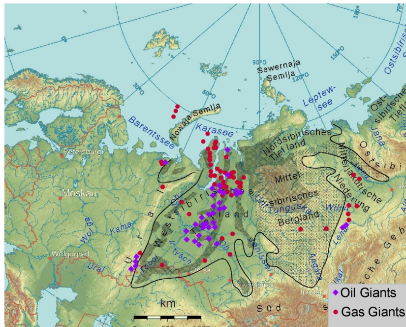
Fig. 4. The relationship between major petroleum and natural gas production wells and the boundary of the Siberian Traps, indicated by the black line. Methane hydrate deposits currently locked in the permafrost within this extensive area upon melting pose a major catastrophe. From [85]

The rifting that occurred east of the Urals 250 million years ago resulted in one of the world's largest petroleum and gas deposits, as shown in Fig. 4 [85]. There is considerable frozen methane trapped in the permafrost in that extensive northern area [86]. Anthropogenic global warming, caused by the near-daily, near-global aerial particulate spraying, poses a serious risk of massively thawing and releasing that entrapped methane to the atmosphere. The potential for another mass-extinction event, should this happen, cannot be dismissed.